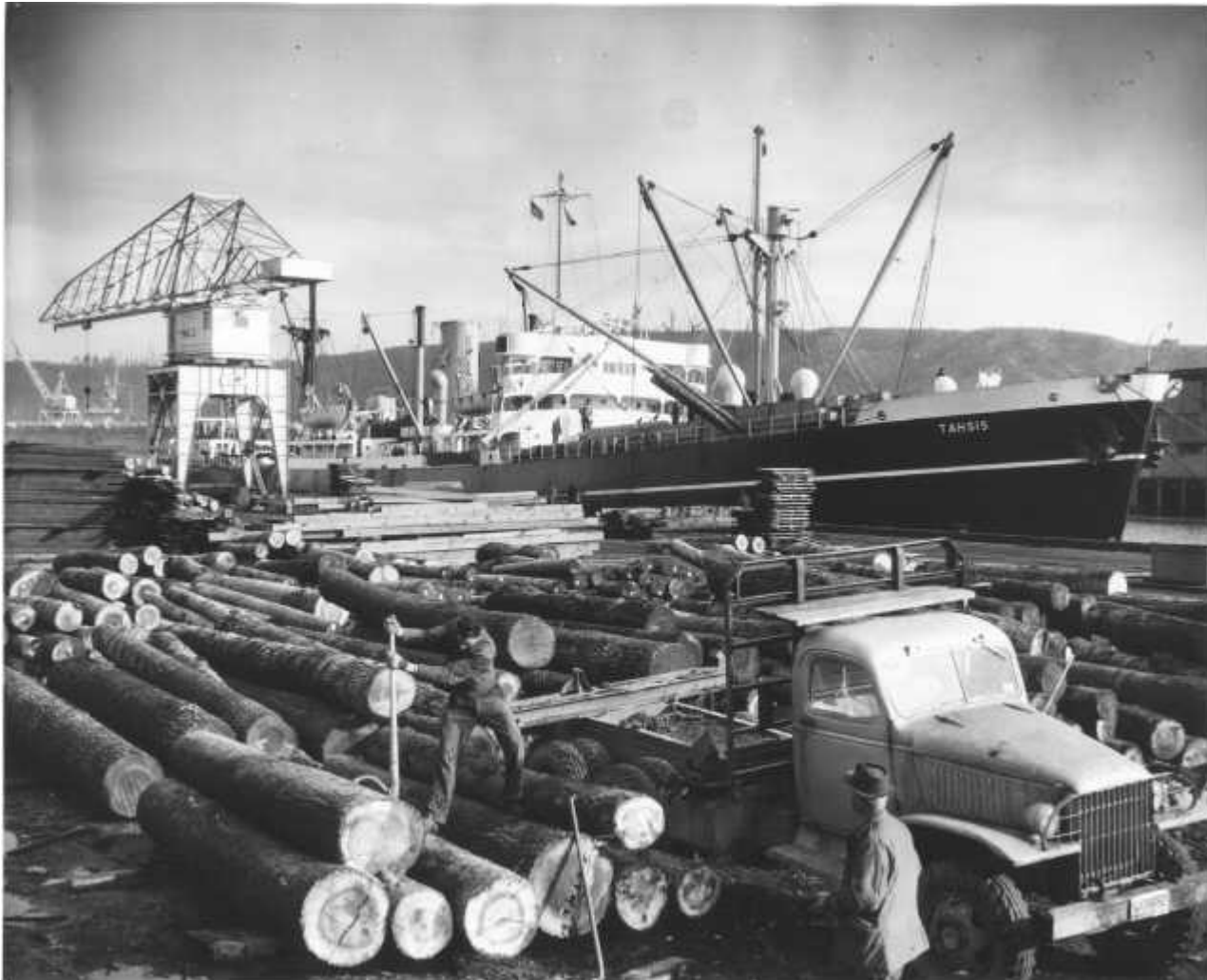
Logs being loaded onto a ship at the South Harbor in Feb. 1948